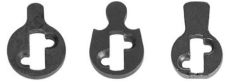
CAM2-AR CAM2-SL CAM2-ST