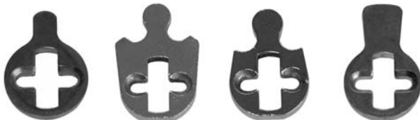
CAM1-AR CAM1-CI CAM1-SL CAM1ST