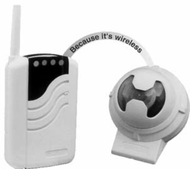
RC-10 Chime Box with Relay TD-10 In/Outdoor Sensor Transmitter

Optex Wireless 1000 Annunciator System alerts you by 3 different chime tones and/or activates other electric devices (e.g. door strikes, lights, siren, CCTV) with relay output (RC-10).