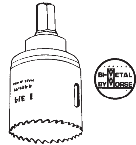
Deep Cutting with Built-In Arbor

Morse Deep Cutting Hole saws offer the same great benefits and features as the TAC series but with the additional benefit of a 1 7/8" cutting depth. Individually boxed.